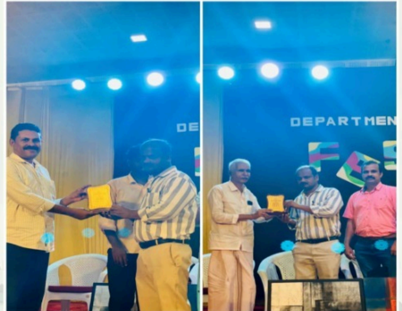
On Electronics department association day, all of the former teachers were invited and honoured at that day