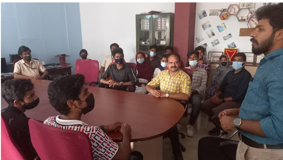
RAJAGIRI COLLEGE IEDC VISIT