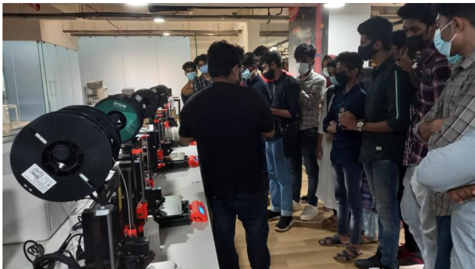
FAB LAB VISIT